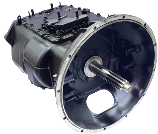
ReNEWed® MANUAL TRANSMISSION